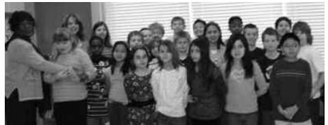
SCHOOL INCLUSION AWARD Harford Hills Elementary School—Grade 5